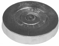
ZEP-B-2 ZEP-B-3 ZEP-B-4 ZEP-B-5 ZEP-B-6