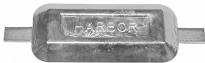
ZCT-2 ZCT-3 ZCT-5 ZCT-6 ZCT-A-2 ZCT-A-3 ZCT-A-5 ZCT-A-6