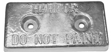
ZHC-23 ZHC-23M w/c'sunk holes on back